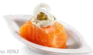
Item no. 10763