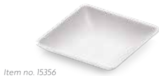
Item no. 15356

In response to the increasing urgency of environmental protection, single-use products containing polymers (such as plates, bowls, cutlery and drinking straws) have been banned in the EU since July 2021. Our sugar cane range is not only an eco-friendly alternative, but also an attractive and perfect solution that complies with the requirements of this legislation.